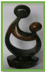
Healer's Touch Sculpture