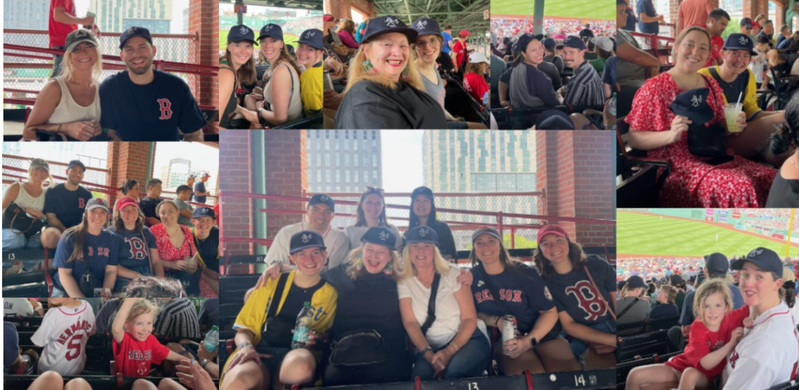
Pictured: Staff from the Healey & AMG Center for ALS at Fenway Park in Boston On Lou Gehrig Day 2024